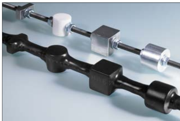
Due to the high shrink ratio HA67 is suitable for complex shapes and dimensions.