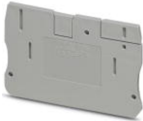
End cover, length: 57.7 mm, width: 2.2 mm, height: 36 mm, color: gray

Please be informed that the data shown in this PDF Document is generated from our Online Catalog. Please find the complete data in the user's documentation. Our General Terms of Use for Downloads are valid ( http://phoenixcontact.com/download )