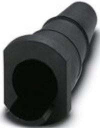
Bend protection sleeve, for cable diameter of 3 mm ... 9 mm, diameter: 12 mm, color: black

Please be informed that the data shown in this PDF Document is generated from our Online Catalog. Please find the complete data in the user's documentation. Our General Terms of Use for Downloads are valid ( http://phoenixcontact.com/download )