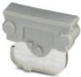
Feed-through connector, length: 10.5 mm, width: 4 mm, color: gray

Feed-through connector - P-FIX - 3038956