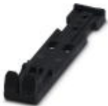
Strain relief, length: 48.7 mm, width: 9.3 mm, number of positions: 2, color: black