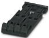
Strain relief, length: 48.7 mm, width: 19.6 mm, number of positions: 4, color: black