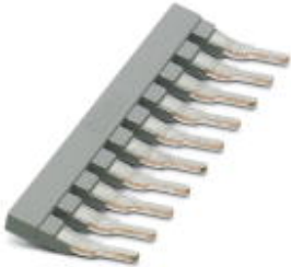
Insertion bridge, pitch: 8 mm, number of positions: 10, color: gray

Please be informed that the data shown in this PDF Document is generated from our Online Catalog. Please find the complete data in the user's documentation. Our General Terms of Use for Downloads are valid ( http://phoenixcontact.com/download )