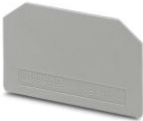
End cover, length: 46 mm, width: 1 mm, height: 28.7 mm, color: gray

Please be informed that the data shown in this PDF Document is generated from our Online Catalog. Please find the complete data in the user's documentation. Our General Terms of Use for Downloads are valid ( http://phoenixcontact.com/download )