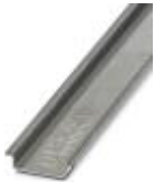
DIN rail, unperforated, Width: 35 mm, Height: 7.5 mm, Length: 2000 mm, Color: silver

DIN rail, unperforated - NS 35/ 7,5 AL UNPERF 2000MM - 0801704