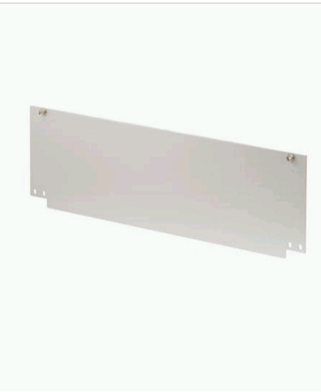
Illustration shows full-width front panel with height 3 U

CHANGING AN ITEM WILL UPDATE THE CATALOG NUMBER. THIS CAN AFFECT THE LIST PRICE AND SPECIFICATION OF THE ITEM.