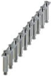
Fixed bridge, pitch: 13 mm, number of positions: 10, color: silver

Please be informed that the data shown in this PDF Document is generated from our Online Catalog. Please find the complete data in the user's documentation. Our General Terms of Use for Downloads are valid ( http://phoenixcontact.com/download )