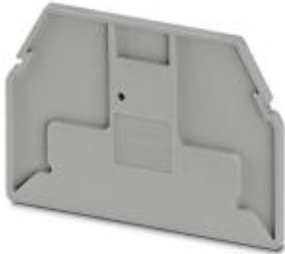
End cover, length: 53.3 mm, width: 2.2 mm, height: 37 mm, color: gray

Please be informed that the data shown in this PDF Document is generated from our Online Catalog. Please find the complete data in the user's documentation. Our General Terms of Use for Downloads are valid ( http://phoenixcontact.com/download )