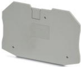
Cover, width: 2.2 mm, color: gray

Please be informed that the data shown in this PDF Document is generated from our Online Catalog. Please find the complete data in the user's documentation. Our General Terms of Use for Downloads are valid ( http://phoenixcontact.com/download )