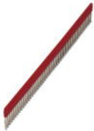
Plug-in bridge, pitch: 5.2 mm, number of positions: 50, color: red

Please be informed that the data shown in this PDF Document is generated from our Online Catalog. Please find the complete data in the user's documentation. Our General Terms of Use for Downloads are valid ( http://phoenixcontact.com/download )