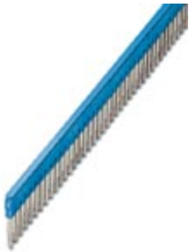
Plug-in bridge, pitch: 6.2 mm, width: 308.3 mm, number of positions: 50, color: blue

Please be informed that the data shown in this PDF Document is generated from our Online Catalog. Please find the complete data in the user's documentation. Our General Terms of Use for Downloads are valid ( http://phoenixcontact.com/download )