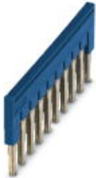
Plug-in bridge, pitch: 6.2 mm, width: 60.3 mm, number of positions: 10, color: blue

Please be informed that the data shown in this PDF Document is generated from our Online Catalog. Please find the complete data in the user's documentation. Our General Terms of Use for Downloads are valid ( http://phoenixcontact.com/download )