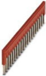
Plug-in bridge, pitch: 5.2 mm, number of positions: 20, color: red

Please be informed that the data shown in this PDF Document is generated from our Online Catalog. Please find the complete data in the user's documentation. Our General Terms of Use for Downloads are valid ( http://phoenixcontact.com/download )