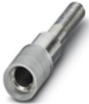
Female test connector, color: gray

Female test connector - PSBJ 4/15/6 GY - 0303396