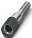
Female test connector, color: black

Female test connector - PSBJ 4/15/6 BK - 0303406