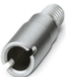
Female test connector, color: silver

Female test connector - PSB 4/7/6 - 0303299