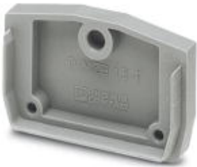
End cover, length: 32 mm, width: 9.9 mm, height: 22 mm, color: gray

Please be informed that the data shown in this PDF Document is generated from our Online Catalog. Please find the complete data in the user's documentation. Our General Terms of Use for Downloads are valid ( http://phoenixcontact.com/download )