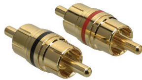
Epitome® (Good) Fig. 11