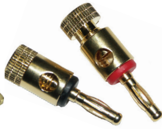
Epitome®-Pro + (Best) Fig. 6