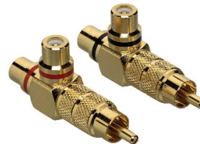
Epitome®-Pro (Better) Fig. 12