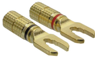
Epitome®-Pro + (Best) Fig. 1