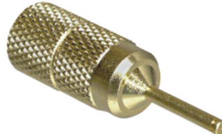
Epitome®-Pro + (Best) Fig. 3