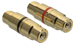
Epitome®-Pro (Better) Fig. 10