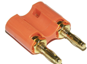
Epitome®-Pro + (Best) Fig. 9