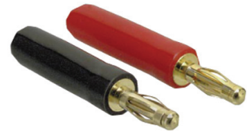
Epitome®-Pro (Better) Fig. 4