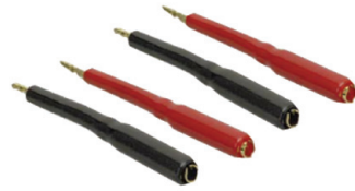
Epitome®-Pro (Better) Fig. 2