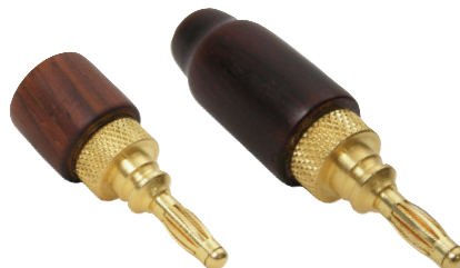
Epitome®-Pro + (Best) Epitome®-Pro + (Best) Fig. 7 Fig. 8