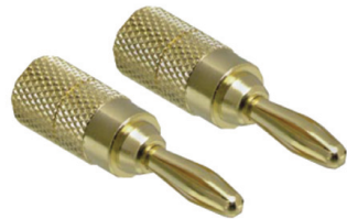
Epitome®-Pro (Better) Fig. 5