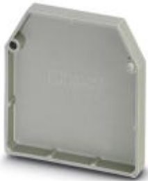
Separating plate, length: 50 mm, width: 7.5 mm, height: 52 mm, color: gray

Please be informed that the data shown in this PDF Document is generated from our Online Catalog. Please find the complete data in the user's documentation. Our General Terms of Use for Downloads are valid ( http://phoenixcontact.com/download )