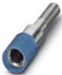
Female test connector, color: blue

Female test connector - PSBJ 4/15/6 BU - 0303354