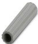
Insulating sleeve, color: gray