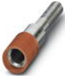
Female test connector, color: red

Female test connector - PSBJ 4/15/6 RD - 0303325