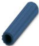
Insulating sleeve, color: blue