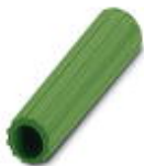
Insulating sleeve, color: green