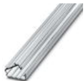
Cover profile, length: 300 mm, color: transparent