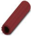
Insulating sleeve, color: red