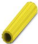
Insulating sleeve, color: yellow