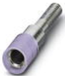
Female test connector, color: violet

Female test connector - PSBJ 4/15/6 VT - 0303383