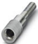
Female test connector, color: gray

Female test connector - PSBJ 4/15/6 GY - 0303396