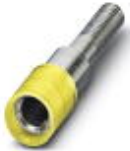
Female test connector, color: yellow

Female test connector - PSBJ 4/15/6 YE - 0303367