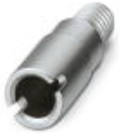
Female test connector, color: silver

Female test connector - PSB 4/7/6 - 0303299