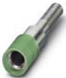
Female test connector, color: green

Female test connector - PSBJ 4/15/6 GN - 0303370