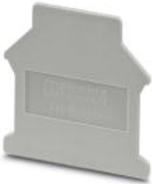
End cover, Length: 42.5 mm, Width: 1.5 mm, Height: 54 mm, Color: gray

Please be informed that the data shown in this PDF Document is generated from our Online Catalog. Please find the complete data in the user's documentation. Our General Terms of Use for Downloads are valid ( http://phoenixcontact.com/download )