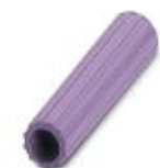
Insulating sleeve, Color: violet