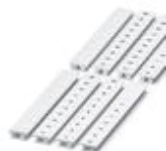
Zack marker strip, can be ordered: Strip, white, labeled according to customer specifications, Mounting type: Snap into tall marker groove, for terminal block width: 8.2 mm, Lettering field: 10.5 x 8.15 mm