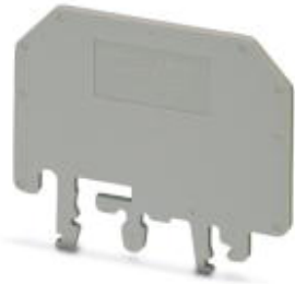
Partition plate, length: 60 mm, width: 2 mm, height: 48.9 mm, color: gray

Please be informed that the data shown in this PDF Document is generated from our Online Catalog. Please find the complete data in the user's documentation. Our General Terms of Use for Downloads are valid ( http://phoenixcontact.com/download )