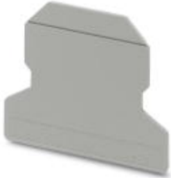
Partition plate, length: 56 mm, width: 1.5 mm, height: 45.7 mm, color: gray

Please be informed that the data shown in this PDF Document is generated from our Online Catalog. Please find the complete data in the user's documentation. Our General Terms of Use for Downloads are valid ( http://phoenixcontact.com/download )