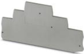
The figure shows a similar product

End cover, Length: 119.5 mm, Width: 2.2 mm, Height: 48.3 mm, Color: gray