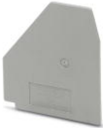
Partition plate, length: 49.1 mm, width: 1.5 mm, height: 69.5 mm, color: gray

Please be informed that the data shown in this PDF Document is generated from our Online Catalog. Please find the complete data in the user's documentation. Our General Terms of Use for Downloads are valid ( http://phoenixcontact.com/download )