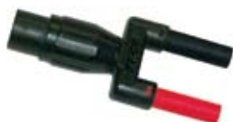
Banana (female) - BNC (male) Adaptor Catalog #2118.46 (optional)

** This model is specifically designed to be used with recorders or power analyzers with a Voltage AC input. A scale factor may need to be entered into the recorder to display the exact value.