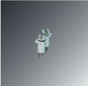
Fixed bridge, number of positions: 2, color: silver

Please be informed that the data shown in this PDF Document is generated from our Online Catalog. Please find the complete data in the user's documentation. Our General Terms of Use for Downloads are valid ( http://phoenixcontact.com/download )