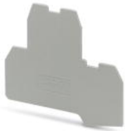
End cover, Length: 77.5 mm, Width: 1.5 mm, Height: 73 mm, Color: gray

Please be informed that the data shown in this PDF Document is generated from our Online Catalog. Please find the complete data in the user's documentation. Our General Terms of Use for Downloads are valid ( http://phoenixcontact.com/download )