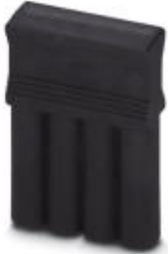
Short-circuit connector, pitch: 8 mm, number of positions: 4, color: black

Please be informed that the data shown in this PDF Document is generated from our Online Catalog. Please find the complete data in the user's documentation. Our General Terms of Use for Downloads are valid ( http://phoenixcontact.com/download )