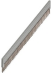
Plug-in bridge, pitch: 3.5 mm, number of positions: 50, color: gray

Please be informed that the data shown in this PDF Document is generated from our Online Catalog. Please find the complete data in the user's documentation. Our General Terms of Use for Downloads are valid ( http://phoenixcontact.com/download )