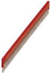
Plug-in bridge, pitch: 3.5 mm, number of positions: 50, color: red

Please be informed that the data shown in this PDF Document is generated from our Online Catalog. Please find the complete data in the user's documentation. Our General Terms of Use for Downloads are valid ( http://phoenixcontact.com/download )