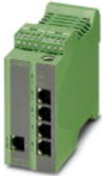
Ethernet Lean Managed Switch with five 10/100 Mbps RJ45 ports

Please be informed that the data shown in this PDF Document is generated from our Online Catalog. Please find the complete data in the user's documentation. Our General Terms of Use for Downloads are valid ( http://phoenixcontact.com/download )