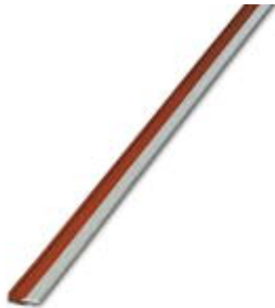
Continuous plug-in bridge, length: 500 mm, color: red

Please be informed that the data shown in this PDF Document is generated from our Online Catalog. Please find the complete data in the user's documentation. Our General Terms of Use for Downloads are valid ( http://phoenixcontact.com/download )