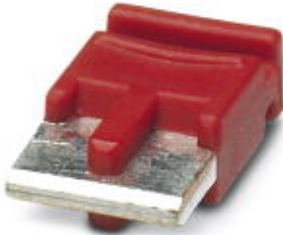
Single plug-in bridge, Length: 6 mm, Number of positions: 2, Color: red

Please be informed that the data shown in this PDF Document is generated from our Online Catalog. Please find the complete data in the user's documentation. Our General Terms of Use for Downloads are valid ( http://phoenixcontact.com/download )