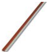
Continuous plug-in bridge, length: 500 mm, color: red

Continuous plug-in bridge - FBST 500-PLC RD - 2966786