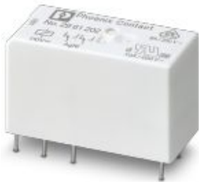
Plug-in miniature power relay, with power contact, 2 PDTs, input voltage 110 V DC

Please be informed that the data shown in this PDF Document is generated from our Online Catalog. Please find the complete data in the user's documentation. Our General Terms of Use for Downloads are valid ( http://phoenixcontact.com/download )