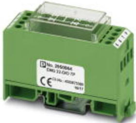
Diode module, for extension with 7 1N 4007 diodes, common cathode

Please be informed that the data shown in this PDF Document is generated from our Online Catalog. Please find the complete data in the user's documentation. Our General Terms of Use for Downloads are valid ( http://phoenixcontact.com/download )