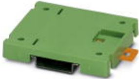
The figure shows version EM-MP 45 N

Mounting plate, for screwing on siz 0 switchgear