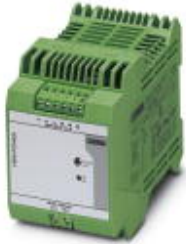
Primary-switched MINI POWER power supply for DIN rail mounting, input: 1-phase, output: 24 V DC/4 A

Please be informed that the data shown in this PDF Document is generated from our Online Catalog. Please find the complete data in the user's documentation. Our General Terms of Use for Downloads are valid ( http://phoenixcontact.com/download )