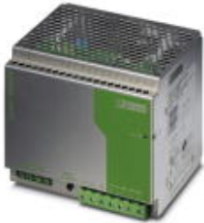
DIN rail power supply unit 24 V DC/20 A, primary switched-mode, 3-phase.

Please be informed that the data shown in this PDF Document is generated from our Online Catalog. Please find the complete data in the user's documentation. Our General Terms of Use for Downloads are valid ( http://phoenixcontact.com/download )