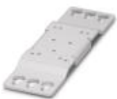
Universal wall adapter for securely mounting the device in the event of strong vibrations. The device is screwed directly onto the mounting surface. The universal wall adapter is attached on the top/bottom.

Assembly adapters - UWA 182/52 - 2938235