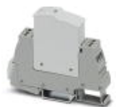
Type 2/3 surge protection, consisting of protective plug and base element with screw connection. For single-phase power supply network with integrated status indicator and remote signaling. Nominal voltage 230 V AC/DC.

Type 3 surge protection device - PLT-SEC-T3-230-FM-UT - 2907919