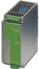
DIN rail power supply unit 24 V DC/5 A, primary switched-mode, 1-phase.

Please be informed that the data shown in this PDF Document is generated from our Online Catalog. Please find the complete data in the user's documentation. Our General Terms of Use for Downloads are valid ( http://phoenixcontact.com/download )