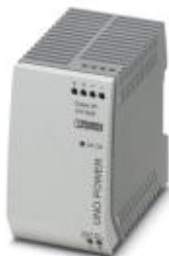
Primary-switched UNO POWER power supply for DIN rail mounting, input: 1-phase, output: 24 V DC/90 W

Please be informed that the data shown in this PDF Document is generated from our Online Catalog. Please find the complete data in the user's documentation. Our General Terms of Use for Downloads are valid ( http://phoenixcontact.com/download )