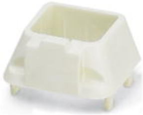
Security frame for SFN switch and patch fields, white

Please be informed that the data shown in this PDF Document is generated from our Online Catalog. Please find the complete data in the user's documentation. Our General Terms of Use for Downloads are valid ( http://phoenixcontact.com/download )