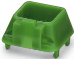
Security frame for SFN switch and patch fields, green

Please be informed that the data shown in this PDF Document is generated from our Online Catalog. Please find the complete data in the user's documentation. Our General Terms of Use for Downloads are valid ( http://phoenixcontact.com/download )