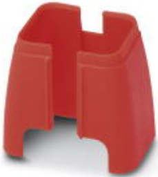
Security element for FL patch cable

Please be informed that the data shown in this PDF Document is generated from our Online Catalog. Please find the complete data in the user's documentation. Our General Terms of Use for Downloads are valid ( http://phoenixcontact.com/download )