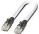
Patch cable, CAT5, assembled, 1 m

Patch cable - FL CAT5 PATCH 1,0 - 2832276