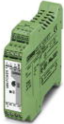
Primary-switched MINI DC/DC converter for DIN rail mounting, input: 1-phase, output: 24 V DC/1 A

Please be informed that the data shown in this PDF Document is generated from our Online Catalog. Please find the complete data in the user's documentation. Our General Terms of Use for Downloads are valid ( http://phoenixcontact.com/download )